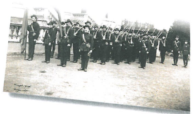
Top: Recruitment leaflet for Irish Citizen Army, 1914.